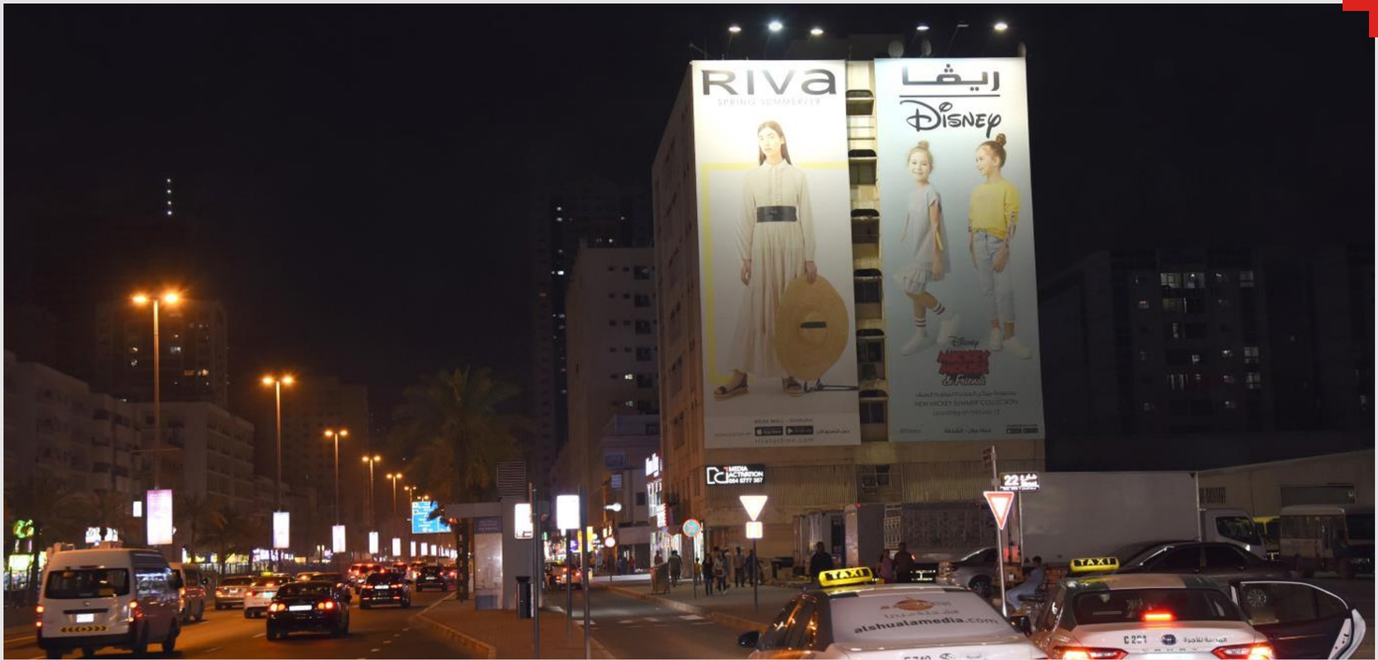
AL WAHDA - A&B